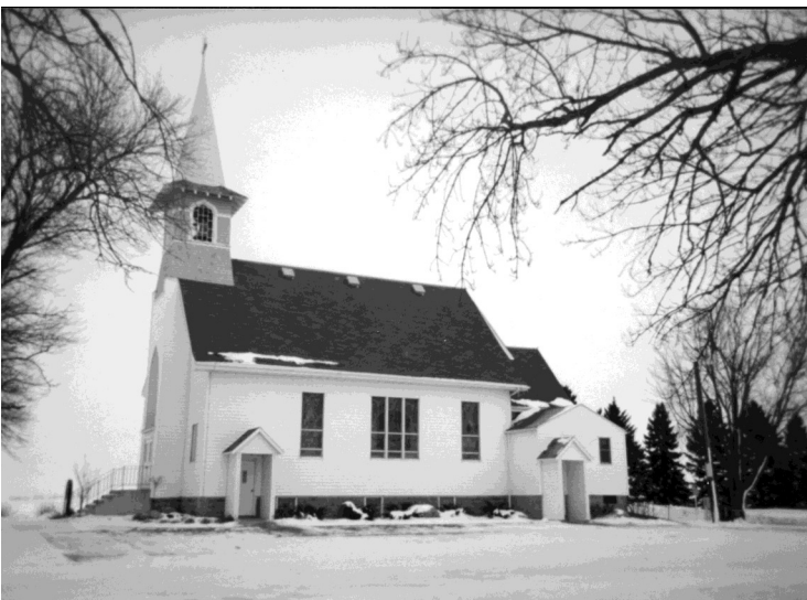
Amo Lutheran Church, 2005

nized in 1886 and closed its doors in 2014. The sanctuary, constructed in 1886-87 and extensively remodeled, still stands in Section 21, just west of where the village of Amo stood. In 1931, the church and it’s adjacent cemetery were separated. The cemetery continues to be overseen by an independent association. The Amo Lutheran Church is in Section 20 on County Road 5. It was organized in 1887 as part of the Old Westbrook parish. The building, constructed in 1915, has been expanded and remodeled over the years. They also have a cemetery east of the church.