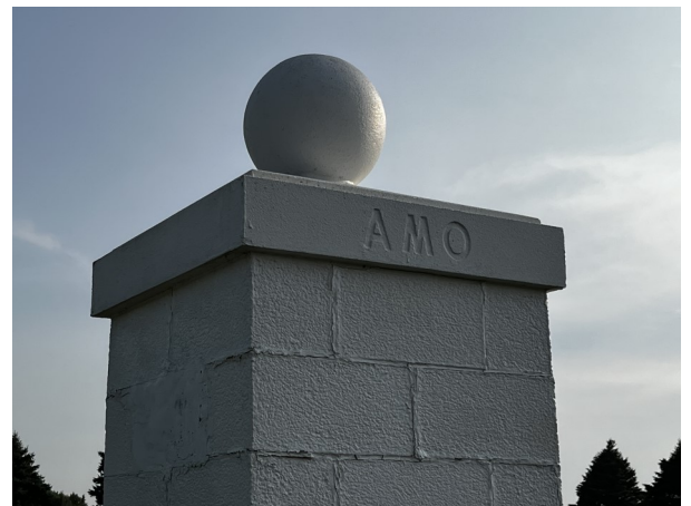
Amo Township Cemetery

Rural Postal Delivery: Four post offices existed at various times in Amo from 1873-1907: the first Amo post office, Warren, Odell and the second Amo. Warren was named for the postmaster’s son; it is not known why the name Odell was selected. Postmasters were farmers or businessmen. There were no post offices in the township between 1876-1880 and 1893-1897. Points of Interest: Lake Augusta, covering 492 square acres, is located in parts of Sections 3, 10 & 11. It outlets to Highwater Creek in Section 20 of Storden Township. Adjacent to the lake is the 720 acre Martin J. Baker Waterfowl Production Area. Two churches have been a part of the township history—Amo Methodist and Amo Lutheran Church. Amo Methodist was orga-