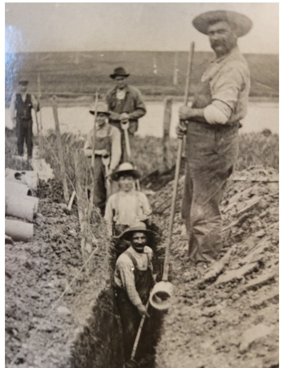
Tiling by hand in Amboy Township