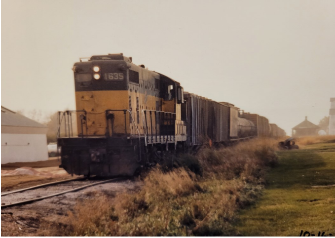
Last train into Jeffers—October 16, 1979

Early History: A stockade, called “Head of the Little Cottonwood”, existed along the Little Cottonwood River in the center of Section 24 briefly in the aftermath of the 1862 Dakota Conflict with a small compliment of militia. It’s existence is documented by a St. Paul