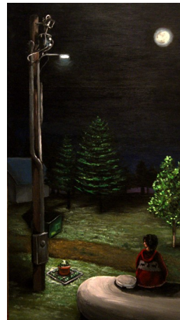
Left: “Among Water & Stone” Best of Show By Carmella Whittaker – Red Rock Central HS