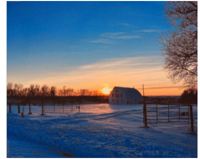
“Celebrating a Country Sunset” Amy Halland—tied for 3rd